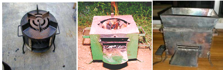
Priyagni Cook Stove

The performance evaluation and experimental study of three different cook stove models such as Priyagni and Harsha and Modified multi fuel cook stoves, have been carried out for water boiling test following BIS standard. All these cook stove models were evaluated for water boiling test and emission test with specific quantity of water in the Aluminium container using the same type of fuel wood prepared as per the BIS standard. Fig. 4.1 Photographic view of various cook stove models during experimental study.